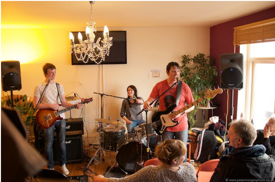
One Time Alive playing above SUSSED at the Green Room

SUSSED provides office, event, meeting space, IT and administration costs. This allows us to operate with a 'pop-up' style - whether organising a small café, frock swap, debate, poetry, presentation or talk.